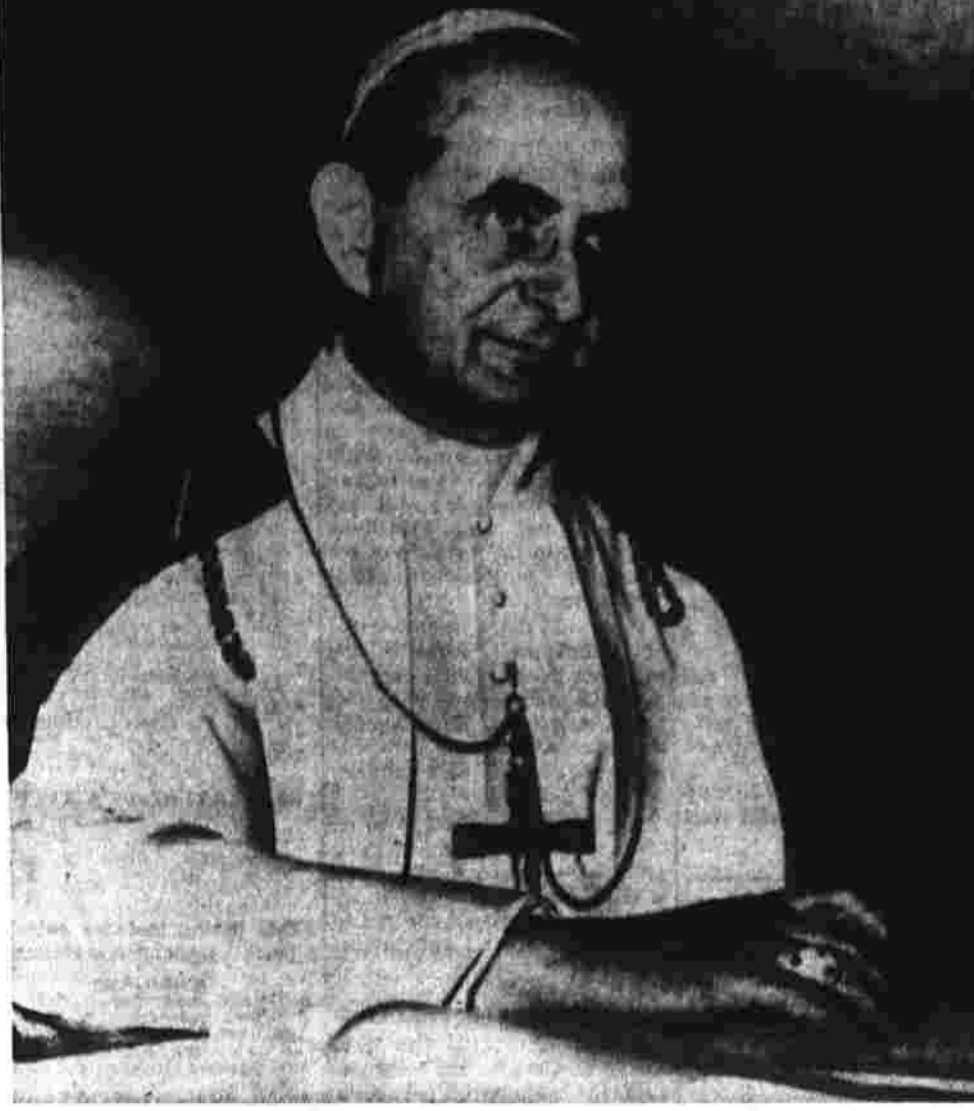
Pope Paul in a Recent Pose at the Apostolic Palace

Murieta. Showtimes Tonight: Bonus... 7:00, 'Murieta'... 8:30, 'Marriage On The Rocks'... 10:30.